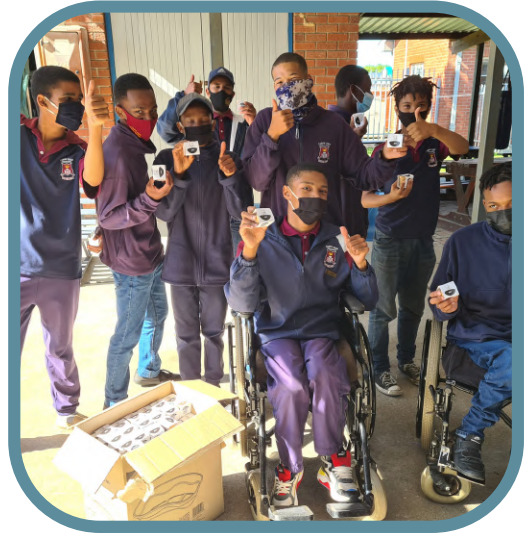
OPENING OUR BOX FILLED WITH VEGGIE PODS!